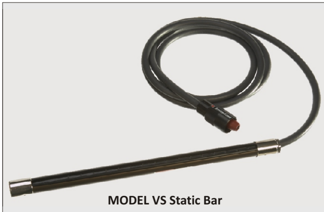
MODEL VS Static Bar