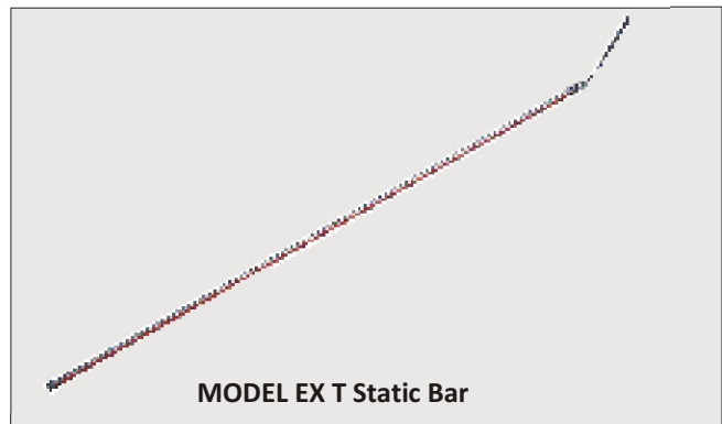
MODEL EX T Static Bar

The design of the El Ex T Ionizing Bar complies with the international ATEX directives in combination with the Model EN 92 or Multistat Ex power supplies. This system is approved for use in manufacturing locations with potentially explosive atmospheres resulting from gases of explosion group IIA, temperature classes T4 to T6.