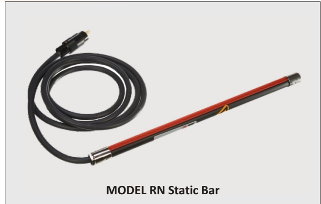
MODEL RN Static Bar

The HAUG RN Ionizing Bar is a powerful and rugged piece of equipment. Production interfering surface charges can be removed reliably and effectively - even at high operating speeds. The coaxial high-voltage plug-and-socket connection of the HAUG system X-2000 offers a unique advantage in that the gas tight high-voltage plug can be connected to the HAUG power pack easily and without tools. The flexible, coaxially shielded cable connects the ionizing unit with the voltage supply. The round construction of the RN ionizing bar permits the exact axial adjustment in the direction of travel of the material. The Ionizing Bar is safe to touch. Special wear-resistant electrodes guarantee long service life.