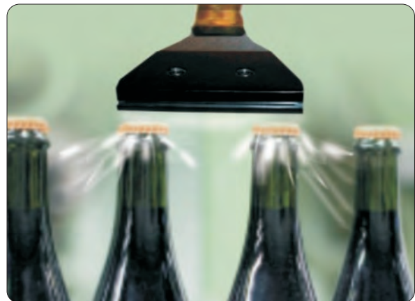
Air Edger™ Flat Jet with .008” gap setting blows water from under the caps on a bottling line moving at high speed

The Nex Flow™ Air Edger™ Flat Jet is available with various size “gaps” all set by a flat shim. Three standard shim sizes are available - .004” (.10 mm), .008” (.2mm) and .020” (.51 mm). One, two or more shims can be “stacked” for a larger gap and greater force.