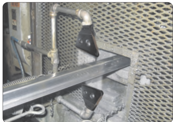
Air Edger™ Flat Jet with .020” gap setting provides a powerful force to blow off dirt and debris in an extrusion line