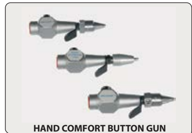
HAND COMFORT BUTTON GUN