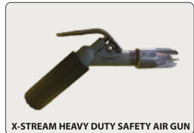
X-STREAM HEAVY DUTY SAFETY AIR GUN