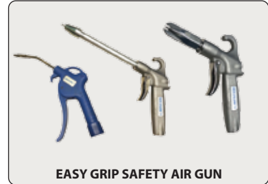
EASY GRIP SAFETY AIR GUN

If a very small nozzle is required the Model 47002AMS – 6 mm stainless steel Air Mag™ Nozzle may also be fitted to the unit.