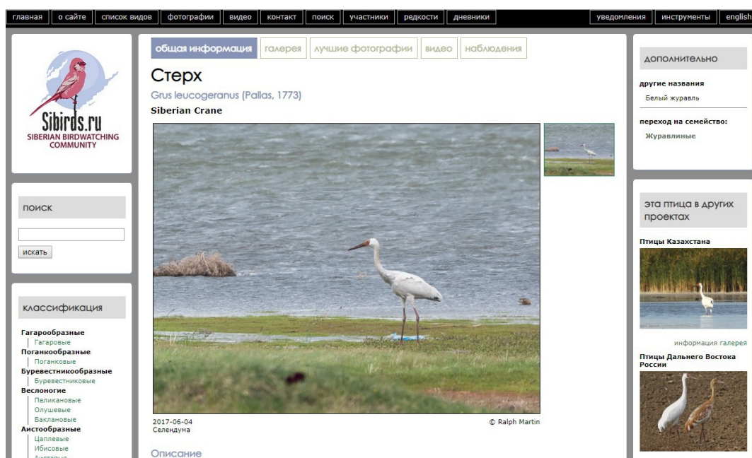
Fig. 5. Siberian Crane page on Siberian website