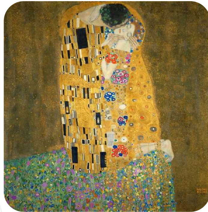
Painting by Gustav Klimt «The Kiss»

Gems Estates draws both interior and exterior inspiration from the works of renowned Austrian artist Gustav Klimt, a master of the symbolist painting style. You will find subtle hints of it throughout the villa, such as the dominant black and gold palette and the graceful curves of its most prominent features.