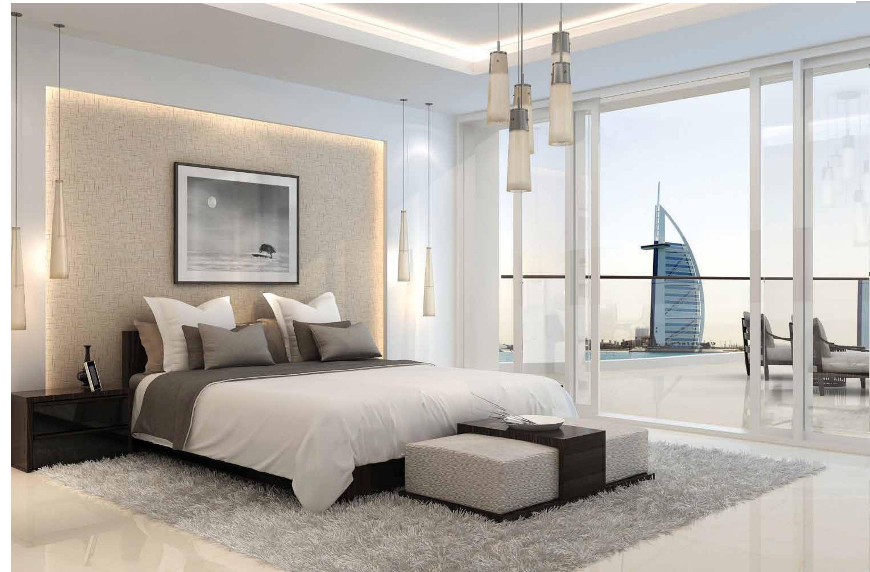
Spacious and well-designed bedrooms with floor-to-ceiling windows and large terrace provide sea view and privacy. All bedrooms are en suite.