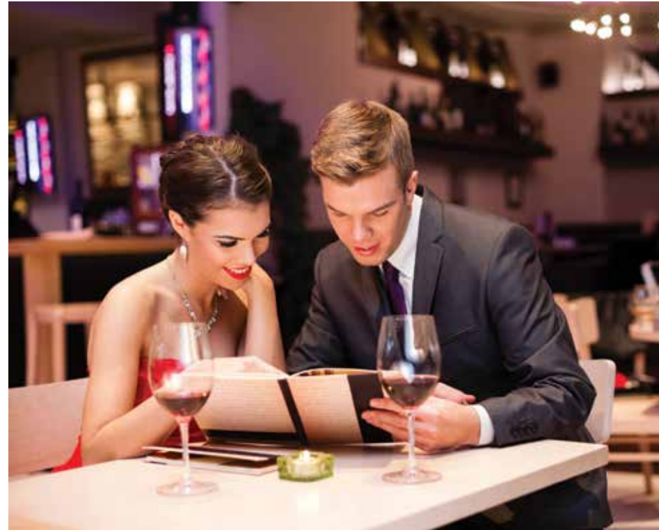
ALL THE AMENITIES OF THE MODERN LIVING WITHOUT EVER LEAVING HOME