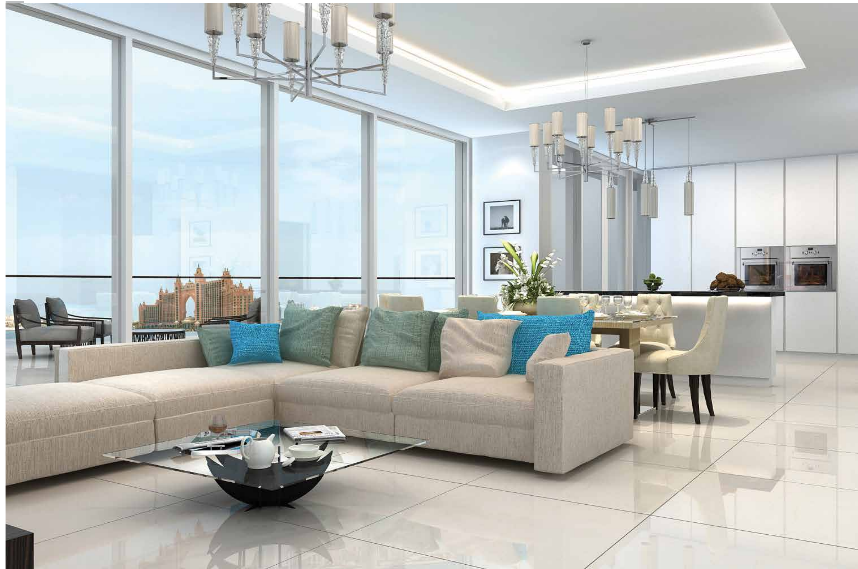
Sleek living room interiors with clean lines, neutral tones and meticulous finishes.