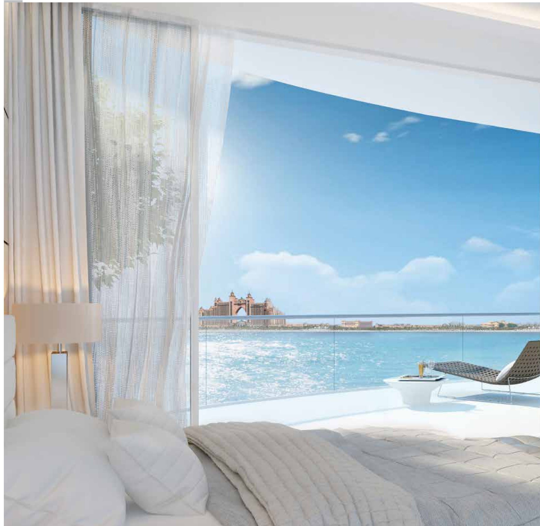
Large private terraces perfectly orientated with views of the Atlantis and the Dubai skyline.